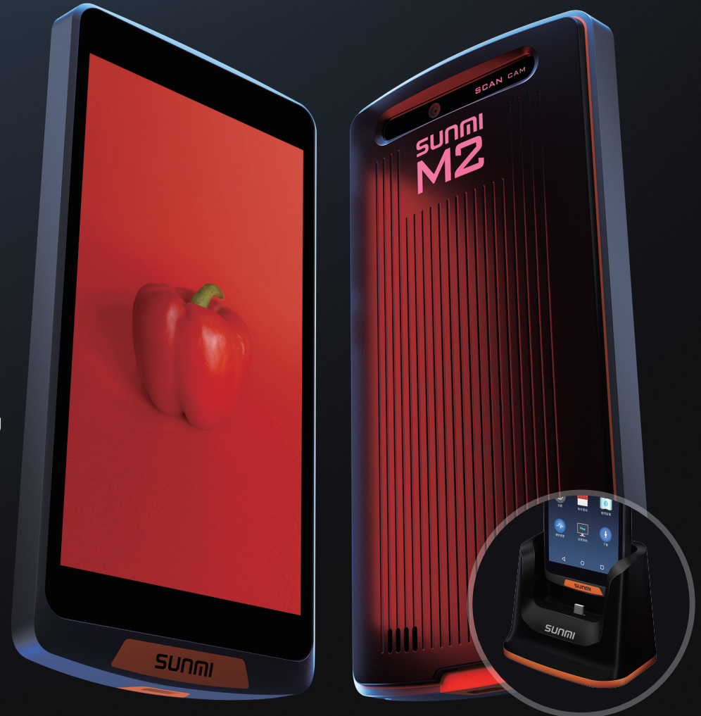
Optional single stand charger